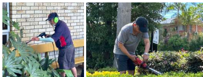
Our most recent working bee to prepare the church for Christmas

Getting Involved: Everybody has some gift or talent to offer to the service of God in the Church. Keep an eye out in this bulletin in the new year for some new opportunities to get involved. To our hundreds of existing volunteers – thank you for all you have done this year. We'd like to thank you in person at our annual Volunteers Mass and Dinner on Tues Feb 13th . Look out for an invitation from your ministry coordinator early in the new year.