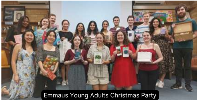
Emmaus Young Adults Christmas Party

Our 3 youth groups, Cana, Antioch and Emmaus are on a break during the holidays. We will resume in 2024. We wish you a Merry Christmas and a Happy New Year!